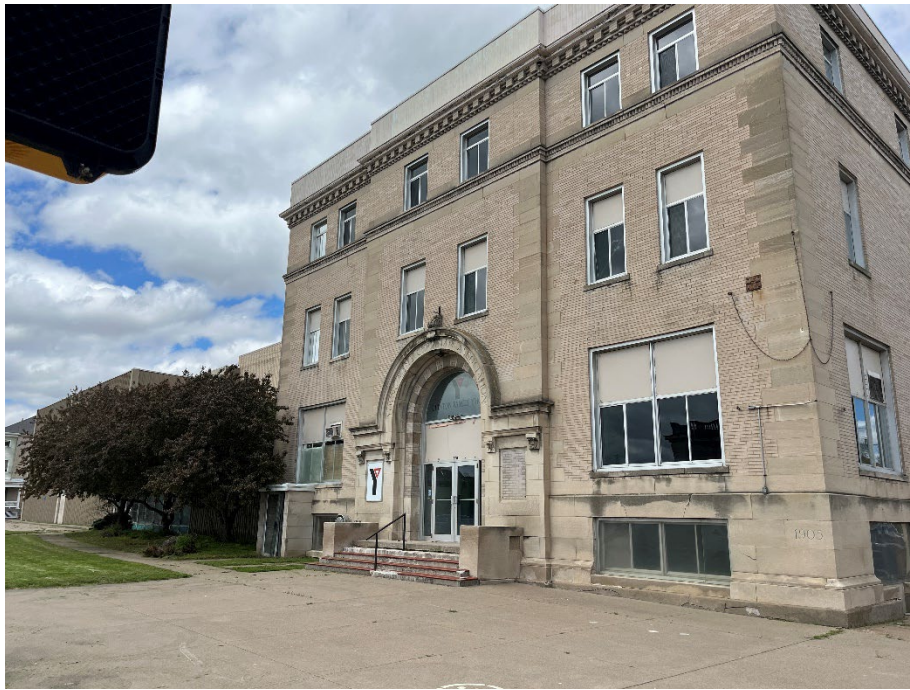
Former YMCA Building 480 South 3 rd Street Clinton, Iowa 52732