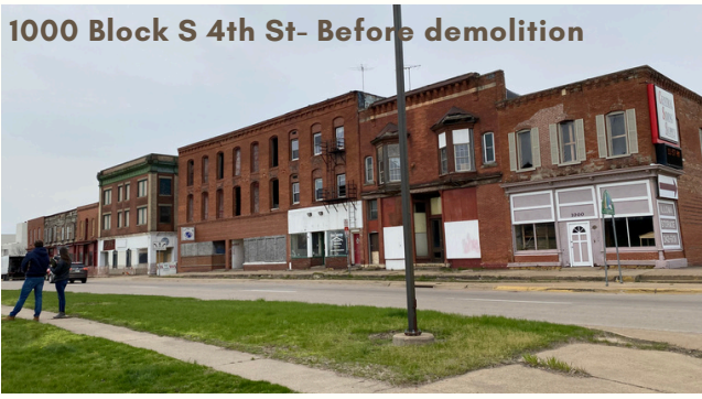
1000 Block S 4th St- Before demolition

Given the age of the buildings the structures were deemed to contain ACM and the buildings were demolished as a RACM demolition. The RACM demolition was financed with City local funds ($100,687), EPA Brownfield Cleanup grant ($500,000), IDNR Brownfield Funds ($24,999), and an ECIA RLF Loan ($441,501).